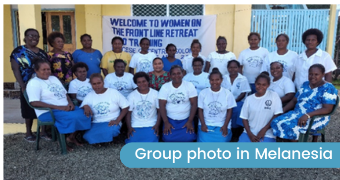
Group photo in Melanesia

The spouses and Mothers Union members in Melanesia were able to recognize their God given gifts, purpose and value in the ministry alongside their husbands. The retreat and reconciliation training enabled them to identify a quiet space to share with each other the challenges they meet in their ministry and enabled them with the opportunity and confidence to speak freely. The Bishops' spouses, clergy wives and Mothers Union members in Melanesia say, one large impact that spells out clearly through this training is the prayer partner.