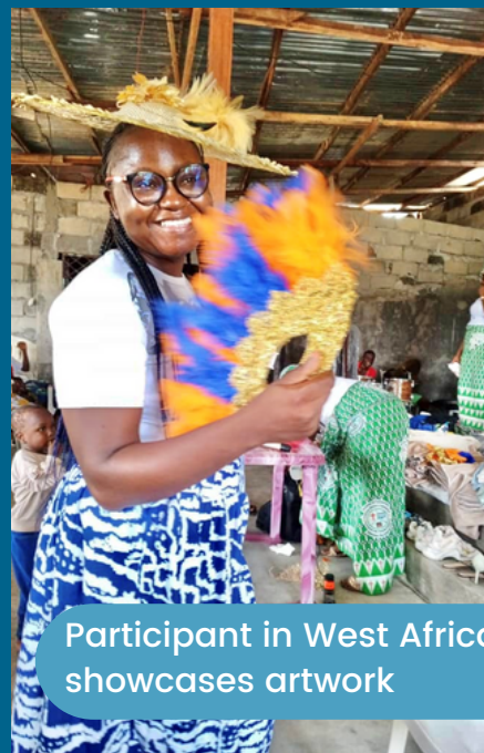
Participant in West Africa showcases artwork