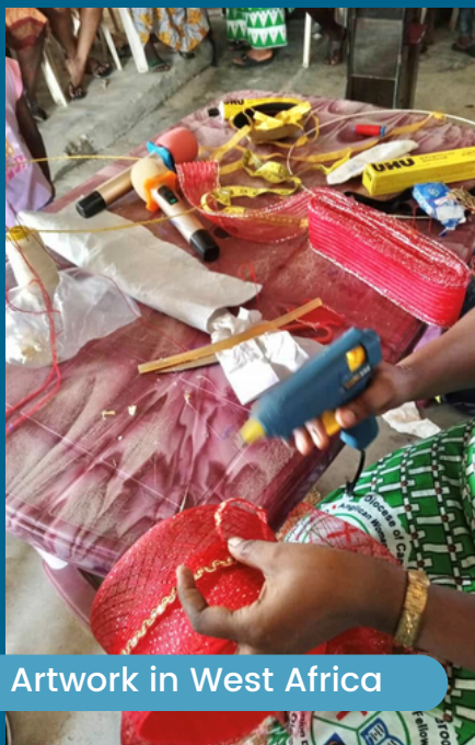
Artwork in West Africa