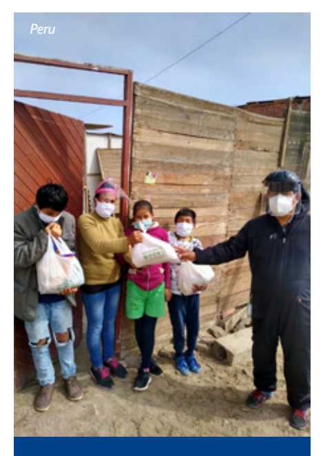
Distribution of essentials