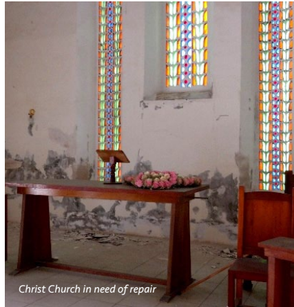
Christ Church in need of repair

In mainly Muslim areas of the world, God's Church provides an important witness through both its presence and its service to the local community. In Palestine and in Yemen, the ACF is helping the local church to minister the light and love of Christ.