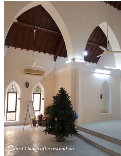
Christ Church after restoration