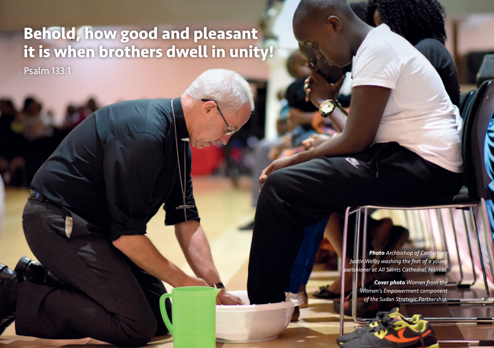
Photo Archbishop of Canterbury Justin Welby washing the feet of a young parishioner at All Saints Cathedral, Nairobi.

Cover photo Women from the Women's Empowerment component of the Sudan Strategic Partnership.