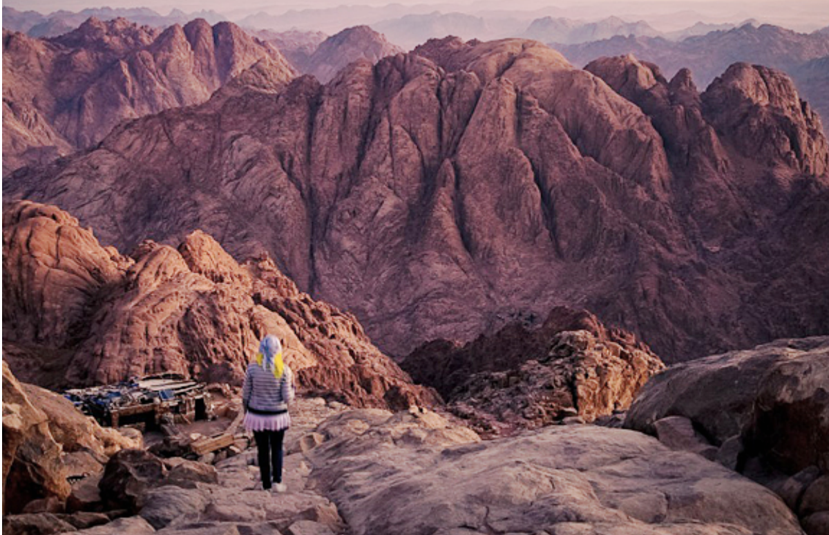
The summit of Mount Sinai

One of the features that marks the Ten Commandments is also typical of the stipulations as a whole. That is the holistic character of the subject matter. Social behavior and religious behavior are treated together. The Old Testament insists that the ways in which we treat each other are inseparable from our relationship to God. Ethics are a religious matter, and worship of the true God is the foundation of all nonmanipulative ethics. Thus the first four commandments are primarily in relation to God while the remaining six have to do with human relationships. But it is clear that the four cannot be separated from the six, nor vice-versa. Although the commandments are, with the exception of the fifth, all prohibitive, they are not negative. They speak about love: love of God and love of others. But what is it to love? If it were necessary to prescribe every loving act and attitude, there would not be enough books in the world. What the commands do is to define the parameters beyond which love cannot exist. This much is then clear: if I love my neighbor I will not steal what belongs to him.